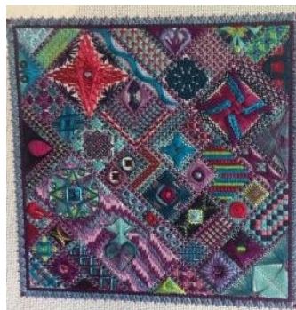
Autumn Kaleidoscope by designer Lorene Salt stitched by Ann Booher.

Not everyone can make our monthly meetings. Following are some finished canvases and projects: